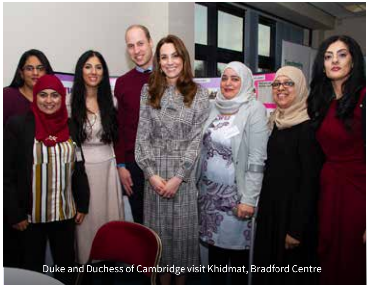
Duke and Duchess of Cambridge visit Khidmat, Bradford Centre

The film employed the unheard voices of family members to demonstrate the wider ripple effect of incarceration on family members. The aim of the project is to raise awareness of particular challenges affecting Muslim women prisoners, where often BAME women remain invisible in the system. To destigmatise the issue of Muslim women prisoners and prompt dialogue and discussion.