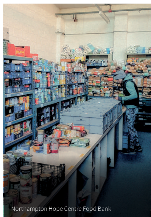
Northampton Hope Centre Food Bank