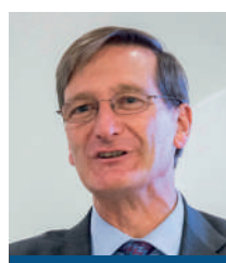
Rt Hon. Dominic Grieve QC MP

"It is refreshing to come across BCBN, which aims to provide solutions from within society itself."