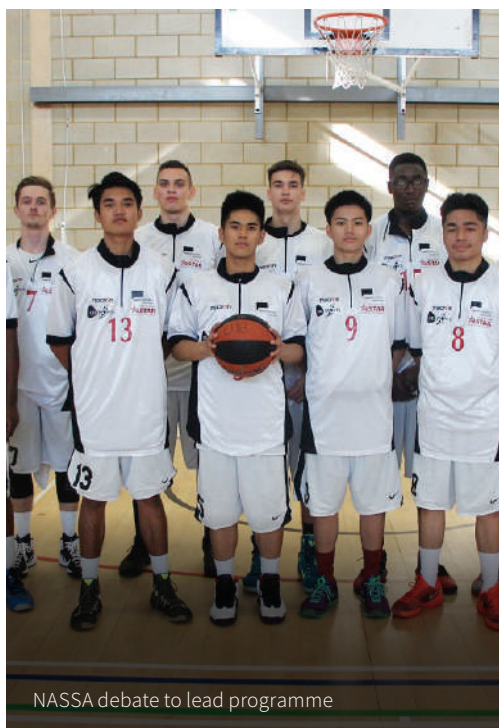
NASSA debate to lead programme