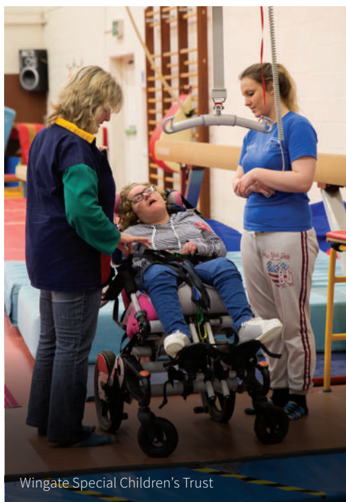
Wingate Special Children's Trust