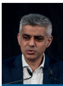
Rt Hon. Sadiq Khan MP

"[BCBN] is a very good, well organised network. People know if they do contribute, their money would go to a good cause. It's not narrowly focused, it moves from one good project to another."