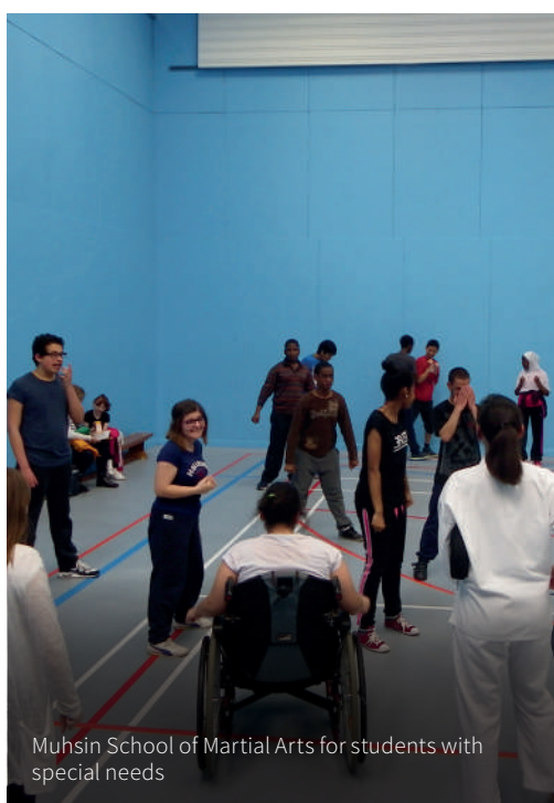
Muhsin School of Martial Arts for students with special needs