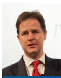
Rt Hon. Nick Clegg MP

"The aims of the network [BCBN] are a tribute to the generosity and far-sighted nature of our Muslim communities in the United Kingdom."