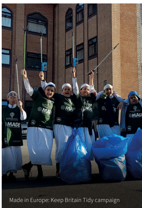
Made in Europe: Keep Britain Tidy campaign