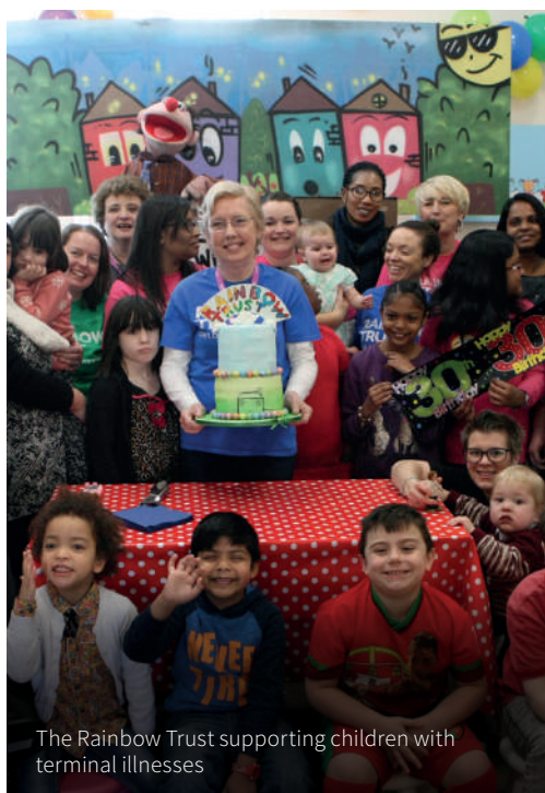
The Rainbow Trust supporting children with terminal illnesses