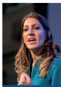
Rt Hon. Dr Rosena Allin-Khan

"I have always believed that BCBN is a pioneering initiative, it selflessly seeks to identify and support the vulnerable and disadvantaged on the margins of our society, whether its refugees, victims of domestics abuse, ex-offenders, young people or smaller charities doing fantastic work in this great city and country of ours."