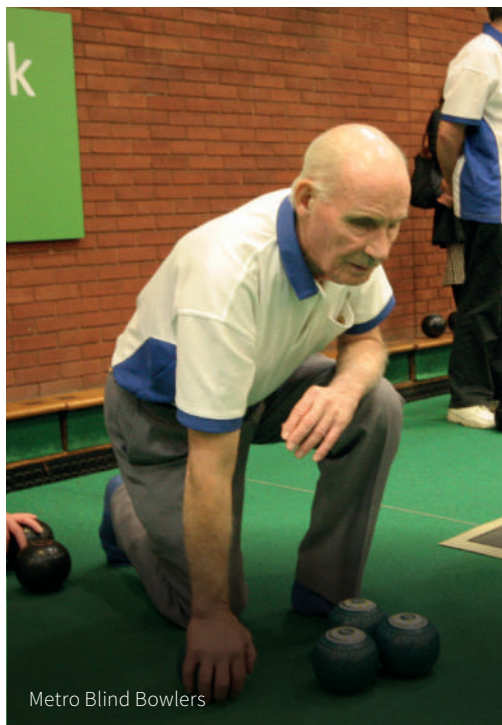
Metro Blind Bowlers