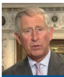
HRH Prince of Wales

"The aims of the network [BCBN] are a tribute to the generosity and far-sighted nature of our Muslim communities in the United Kingdom."