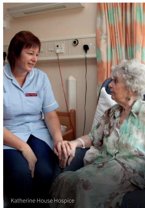
Katherine House Hospice