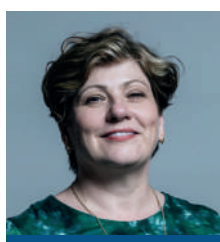
Rt Hon. Emily Thornberry MP

"It's a fantastic organisation that brings together the very best of humanity in one room, people working towards the greater good. You [BCBN] do essential working in bringing the business community together to act as agents of change to support our third sector organisation"