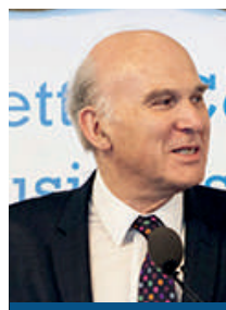
Sir. Rt Hon. Vince Cable MP

"BCBN brings businesses together to support charities – I really applaud their work, thank them for stepping up to the plate and giving us all a safer Society and giving all of our young people a better future."