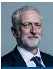
Rt Hon. Jeremy Corbyn MP

"As someone who is a great supporter of grass root projects, I do believe BCBN is a model for others to follow."